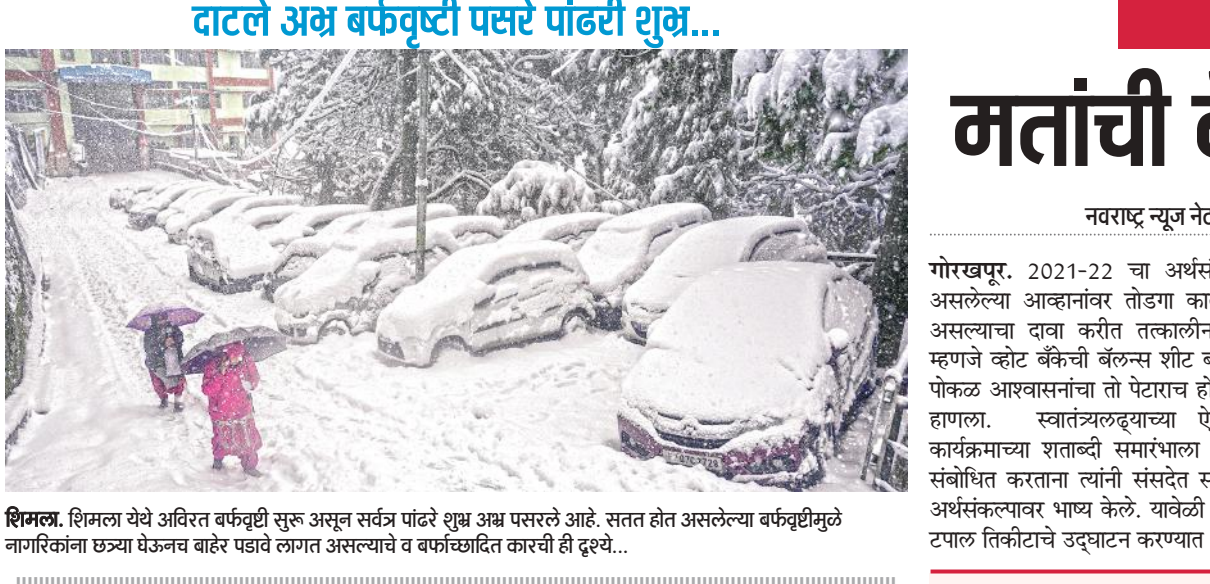
शिमला. शिमला येथे अतिरिक्त बर्फवृष्टी सुरू असून सर्वत्र पांढरे शुभ्र अन्न पसरले आहे. सतत होत असलेल्या बर्फवृष्टीमुळे नागरिकांना छत्र्या घेऊनच बाहेर पडावे लागत असल्याचे व बर्फाच्छादित कारकी ही दृश्ये...

अहवाल सादर करणे आवश्यक प्राप्त देणगीचा अहवाल निवडणूक आयोगाला सादर करताना राजकीय पक्ष 20 हजार रुपयांवरील रकमेचाच उल्लेख करतो. काँग्रेसने आपल्या अहवालात 139 कोटी रुपये